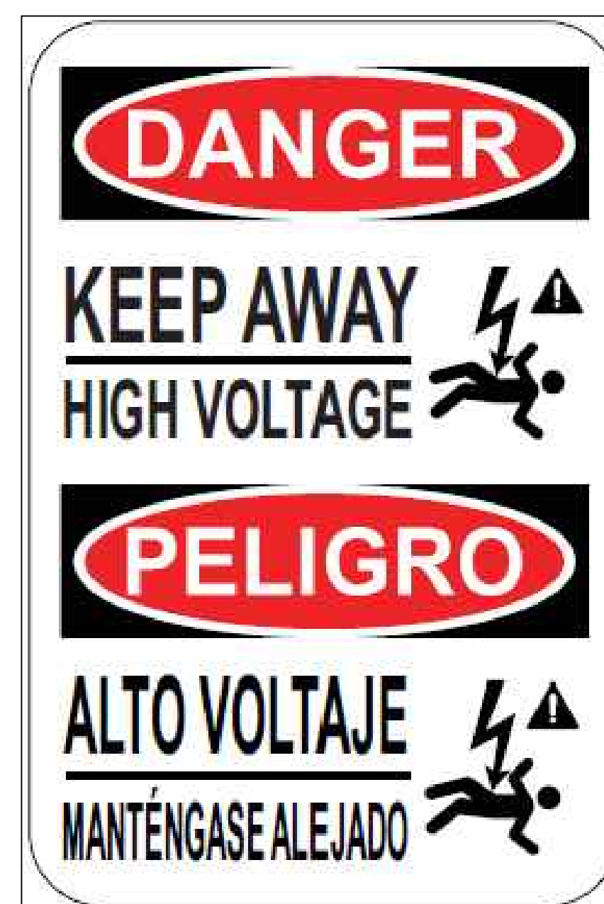
FENCE SAFETY SIGNS (INSTALLED ON FENCE EVERY 200 FEET)